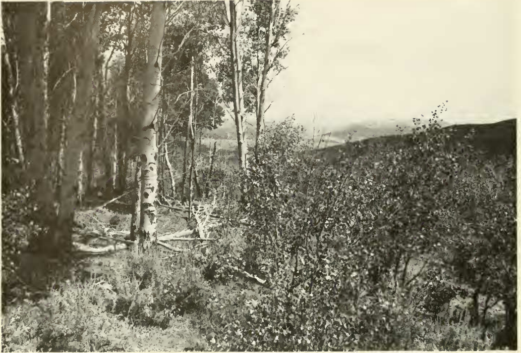
Fig. 2 continued: C, site 3.

on the site before treatment. The aspen regeneration at the Mosquito Lake study area had not stabilized at pretreatment densities after 22 growing seasons. This lack of stability can be attributed in part to use by both domestic livestock and wildlife. Jones (1976) has indicated that 50,000 to 75,000 suckers/ha in the first year after disturbance is not excessive because of the natural thinning that occurs in aspen stands. The suckers had